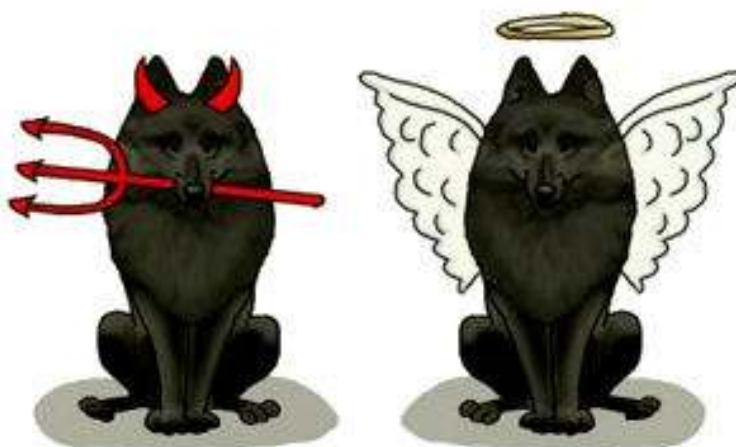
NAUGHTY AND NICE