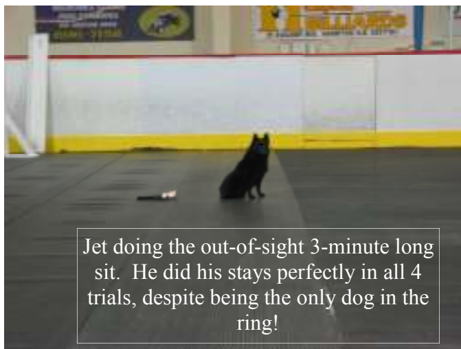
Jet doing the out-of-sight 3-minute long sit. He did his stays perfectly in all 4 trials, despite being the only dog in the ring!

The show site was a less than 10 minute drive from where we were staying, it was perfect. Unfortunately, we did not qualify in any of the trials. We were actually the only dogs entered in Open and Utility in 3 out of the 4 trials, and there was only 1 other dog in the fourth. There were many more dogs entered in the Rally Obedience. All in all, although obviously I was disappointed that we did not qualify, they did improve as the week went on, so I was not completely discouraged. I think they combination of the stress of the travel and the fact that I did rush their training a bit to try and be ready for the Specialty contributed to our lack of success. They both had some very nicely performed exercises in between the non-qualifying ones, so I know it is only a matter of time. We will put it all together one of these days. It would have been nice for it to be at the Specialty but perhaps another year!