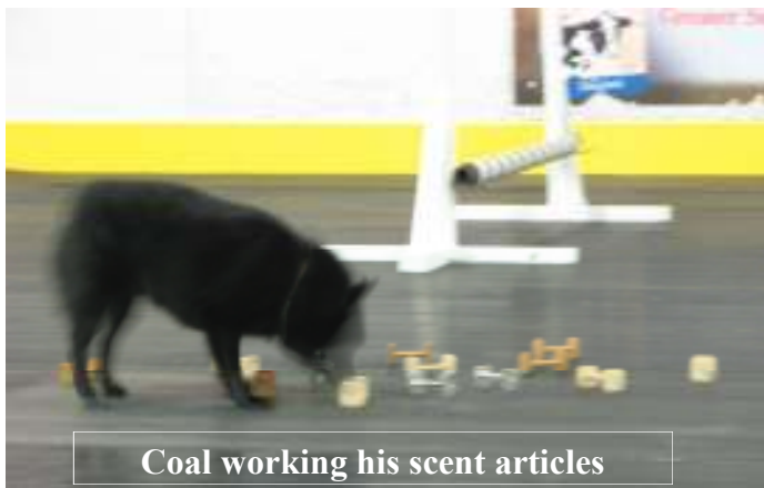
Coal working his scent articles

quite well, although we continued to have some issues with directed jumping and then an injury a few weeks before required he be restricted in activity, so no jumping practice. Jet was actually doing very well and I was pleased with his progress.