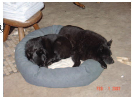
Sharing a Nap with a Granddaughter

Loki came to me a 3 month old baby, full of the devil and rarin' to go. She took over the Rottweilers who decided that dynamite came in small packages and they weren't going to mess with her.