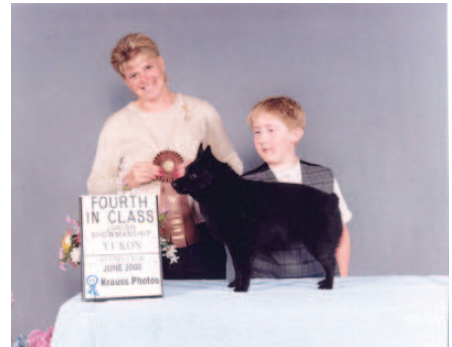
Helping out a new Junior