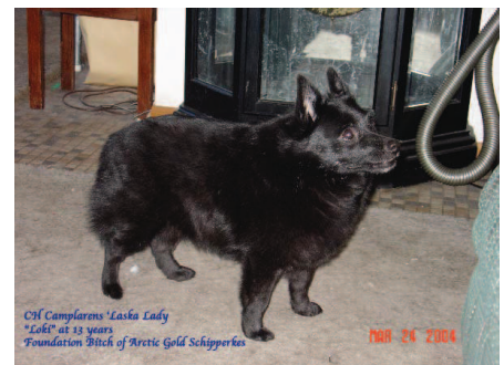
Ch Camplarens 'Laska Lady 'Loki' at 13 years Foundation of Arctic Gold Schipperkes