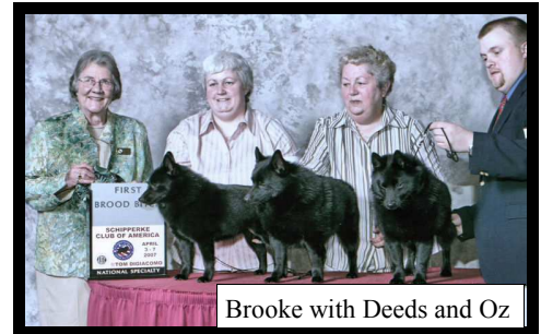
Brooke with Deeds and Oz

Brooke (Ch. Mardecks Laptop Model) with Deeds & Oz (Ch. Madecks Whiz Kid De Turenne) as "get", went 1st place brood bitch (she also did the same at the Canadian National Specialty last August)