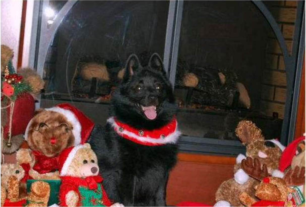
This is Paddy Murphy better known as I'm the Puppy Kleingaul's Ultimate Catch

To all the little Black Devil Dogs & their Families