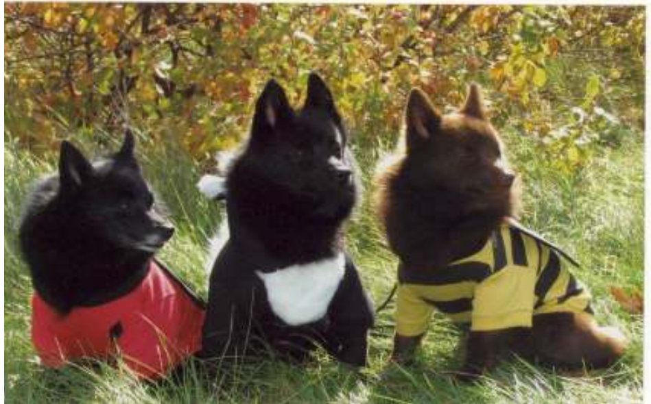
Zöe (10 1/2) Lady bug Aimée(6 1/2) Skunk Coco (4 1/2) BumbleBee

Well, that's an update for now- having more fun "going to the dogs" than doing the commercial side of photography- but that's life ! Kit Wilson